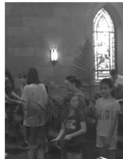
WAVING PALM BRANCHES