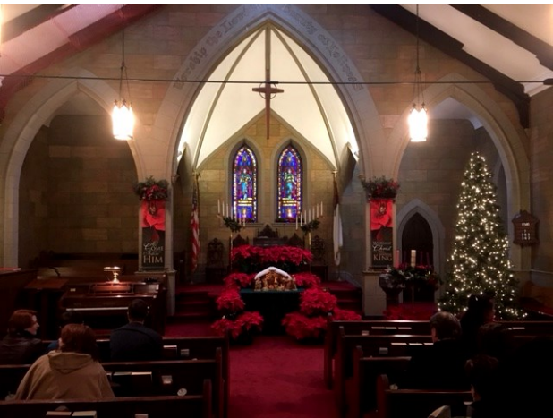
CHRISTMAS EVE 2018